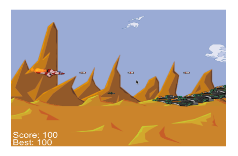
Figure 2: Game prototype used for architecture evaluation.

The game play is very simple: the player plays as a space ship inside the galactic space, and he needs to destroy (by shooting them) the enemies ships from a game. Every time the space ship make physical contact with a enemy, or with a enemy shot, it looses energy. The objective is to destroy the maximum number enemy in the smaller amount of time, without running out of energy. An screenshot of the game can be seen on Figure 2.