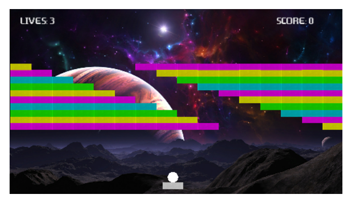
Fig. 1. Example Scene of Arkanoid Game

that serves as an obstacle. Finally, there are special power-up blocks that give the player a special ability when destroyed. Fig. 1 presents our implementation of Arkanoid.