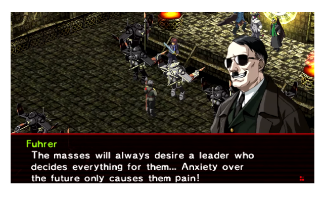
Fig. 3. The rumors brought Fuhrer back to life, a dictator who caused most of the city's destruction alongside Joker and the cult members

as guiding guardians who provide advice and explanations but cannot defend the party members physically.