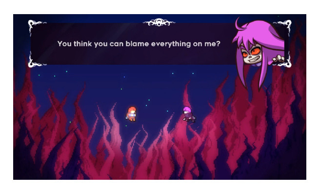
Fig. 6. Madeline's shadow reaction after the rejection

brings both of them to the bottom of the mountain, making Madeline lose all her progress, thus symbolizing the harmful consequences of repressing or denying oneself shadow .