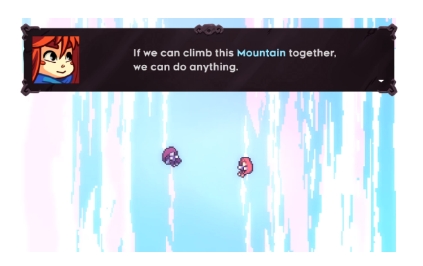
Fig. 7. Madeline working together with her shadow

strawberry pie for her new friends with all the strawberries collected throughout the game, influencing the game's ending. The more strawberries collected, the better the pie is, changing characters' reactions to the pie. The game hinted at the importance of gathering them by saying through loading screen messages that it would impress friends (Fig. 8), consequently encouraging players to face as many obstacles and challenges as possible.