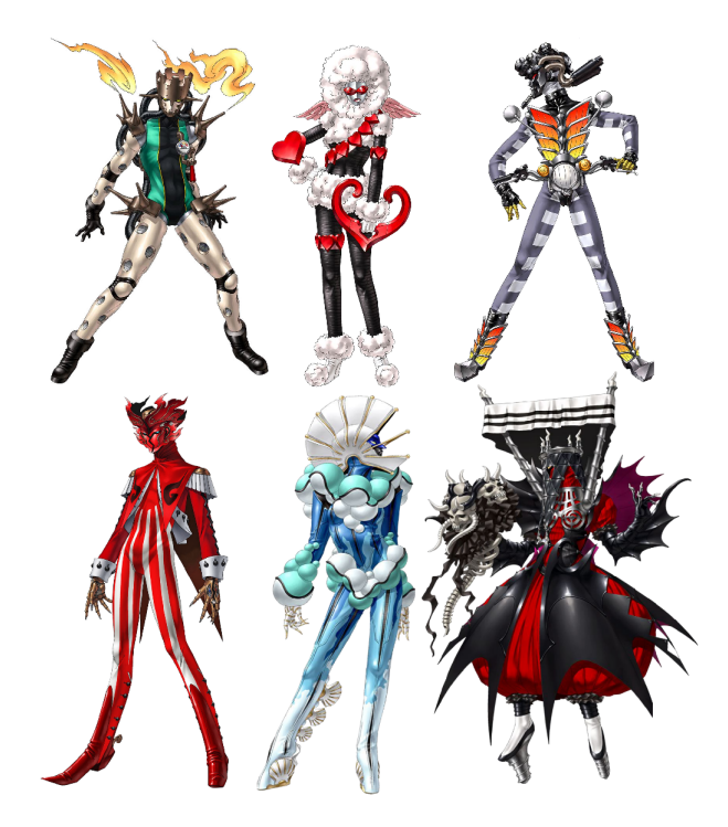
Fig. 1. Initial and Ultimate forms of Tatsuya, Lisa and Eikichi's main Personas respectively; First row: Vulcanus, Eros, Rhadamanthus ; and second row: Apolo, Venus, Hades

All Persona users have their initial Persona : one that reflects the user's most inner thoughts and core personality, usually represented by a less significant mythological equivalent. The characters that can use them sometime during their life played the "Persona" game: a ritual that unlocks the ability to summon the Persona . The most typical route in which the initial Persona becomes fully activated during the game's story is when the character is confronted with great danger, allowing them to self-defend from enemies.