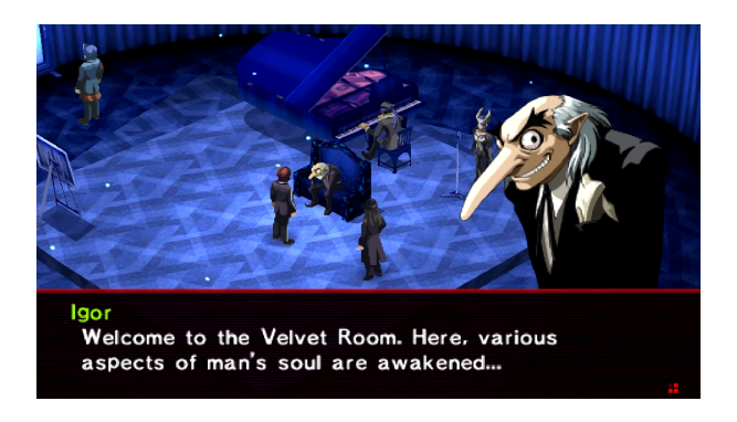
Fig. 2. The Velvet Room: a place where players can summon new Personas

Persona users have to use the tarot cards collected from demon contracts to summon new Personas at the "Velvet Room" (Fig. 2). Philemon and his assistants, who act as critical guiding figures, inhabit this place. Since the first conversations, they constantly have mentioned concepts of finding the truth inside oneself and the relation of Personas and demons to the collective unconscious, guiding the characters when facing the world full of rumors.