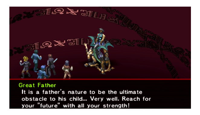
Fig. 4. Final battle with Nyarlathotep, who is shaped to represent the party members' fathers

The narrative structure of Persona 2: Innocent Sin presents a structure similar to the Hero's Journey, although it is not