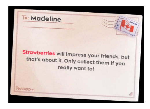
Fig. 8. How Celeste hints the importance of collecting strawberries

strawberry pie for her new friends with all the strawberries collected throughout the game, influencing the game's ending. The more strawberries collected, the better the pie is, changing characters' reactions to the pie. The game hinted at the importance of gathering them by saying through loading screen messages that it would impress friends (Fig. 8), consequently encouraging players to face as many obstacles and challenges as possible.